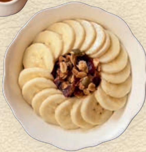
Banana Yogurt 198.- Natural yogurt · Fresh bananas · Granola