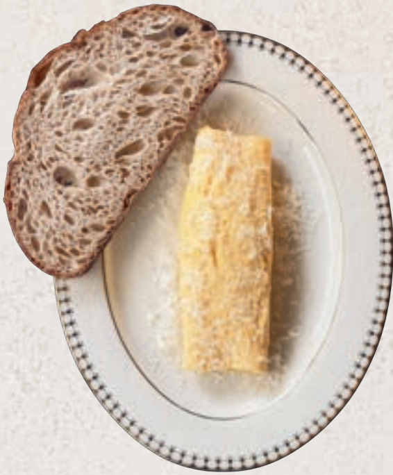
Parmesan Omelette 198.-