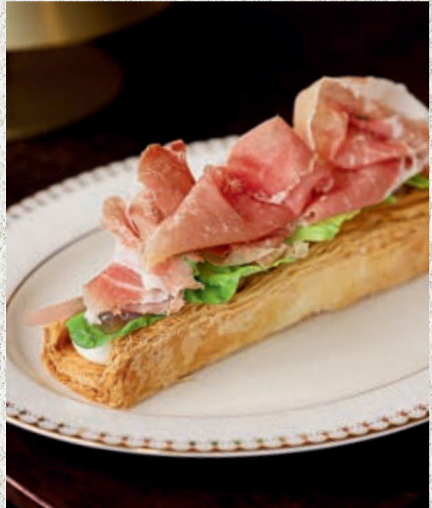
Prosciutto Sandwich 398.-

House-cured salmon · Lemon cream · Baby cos · House-made onion pickles · Puff pastry