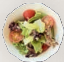
Green Salad 58.-