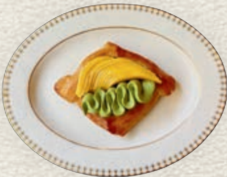
Matcha Mango Danish 168.- Matcha white choc cream · Mango