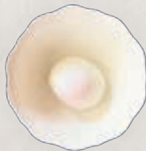
Poached Egg 38.-