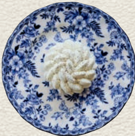
Vanilla Entremet 288.-

Madagascar vanilla cream · Almond praline · Soft biscuit