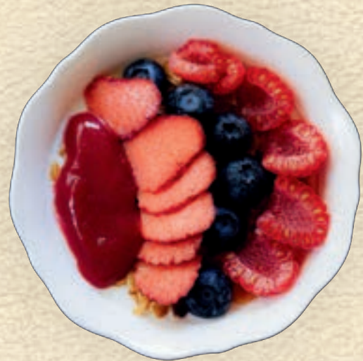
Mix Berry Yogurt Bowl 198.- Natural yogurt · Fresh red berries · Granola