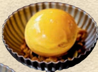
Mango Sorbet 148.-