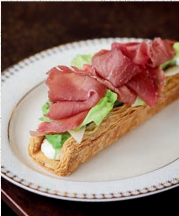
Cured Beef Sandwich 458.-

Bresaola punta d'anca · Parmesan cream · Rocket · Baby cos · House-made onion pickles · Puff pastry