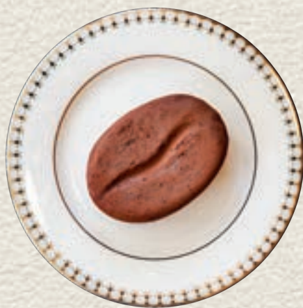
Coffee Entremet 288.-

A modern reimagining: velvety chocolate sponge and tart cherry compote, crowned with delicate cacao butterflies.