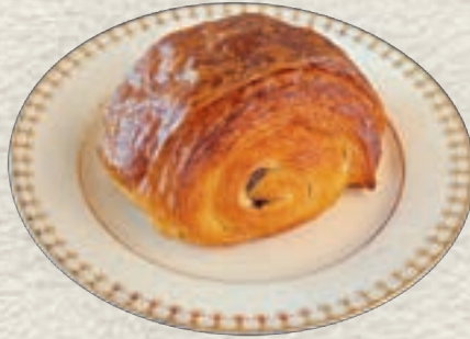
Pain au Chocolat 168.- Sourdough croissant · Valrhona chocolate