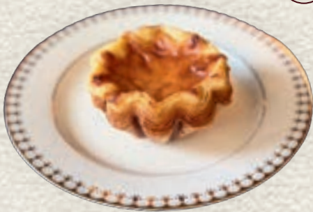
Flan Tart 198.- Classic French Style Custard Tart