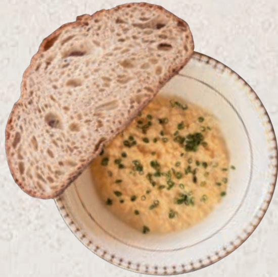
Parmesan Scrambled Egg 198.-