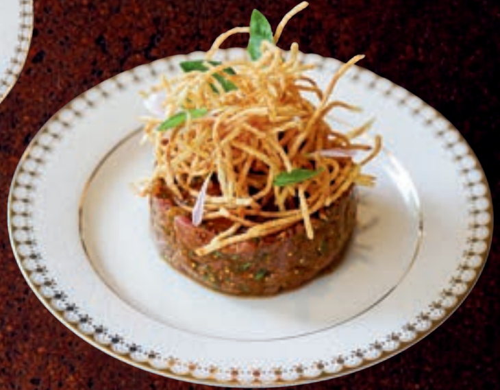
Beef Tartare 788.-

Japanese sea bream · Avocado · Citrus vinaigrette