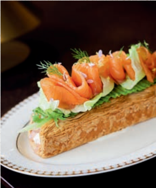
Salmon Gravlax Sandwich 428.-

House-cured salmon · Lemon cream · Baby cos · House-made onion pickles · Puff pastry