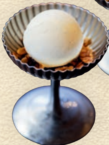
Smoked Vanilla Ice-cream 148.-