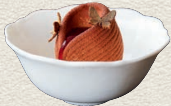
Black Forest 288.-

Madagascar vanilla cream · Almond praline · Soft biscuit