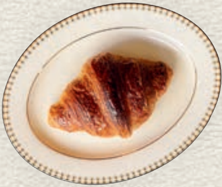
Rustic Croissant 128.- Sourdough croissant · Crisp crust · Complex flavor