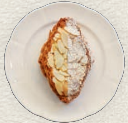
Rustic Almond Croissant 188.- Almond frangipane cream · Sourdough croissant