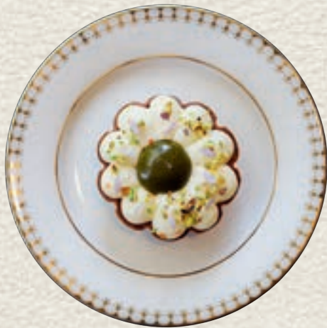
Pistachio & Orange Tart 288.-

Orange blossom cream · Pistachio praline · Bright citrus notes