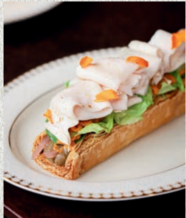
Chicken Masala Sandwich 358.-

Eggplant caviar · Tomatoes · Basil · House-made onion pickles · Baby cos · Puff pastry