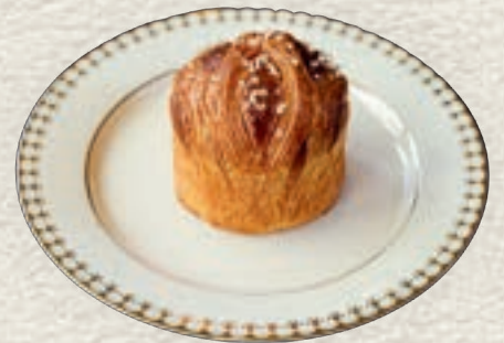
Vanilla Brioche 148.- Soft Brioche · Vanilla cream