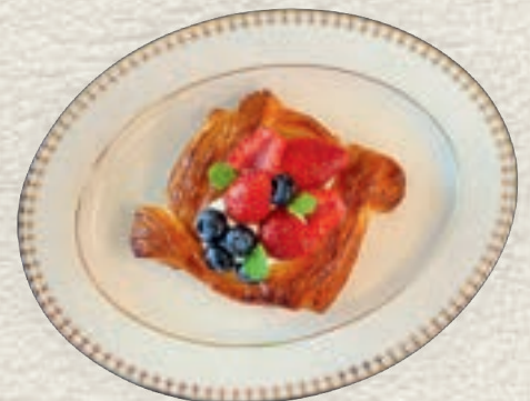
Mixed Berry Danish 188.- Vanilla cream · fresh mix berry