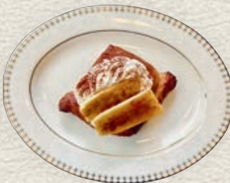
Banana Pecan Danish 168.- Banana · Signature pecan spread · Chantilly