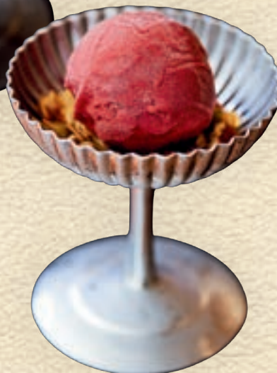
Ember Raspberry Sorbet 148.-