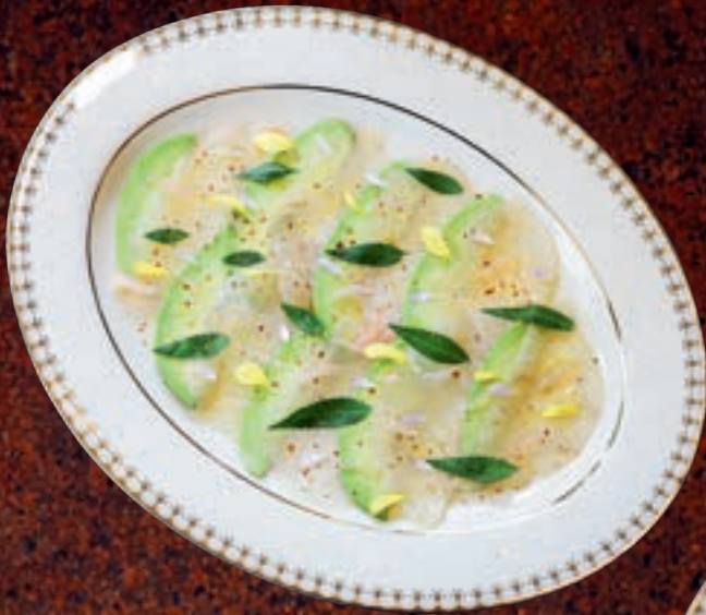
Madai Carpaccio 588.-

Japanese sea bream · Avocado · Citrus vinaigrette